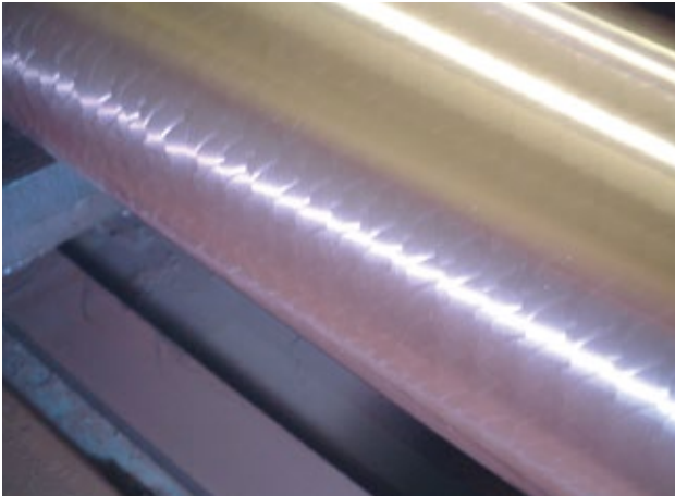
Abrasive trace of 704-type grinding wheel