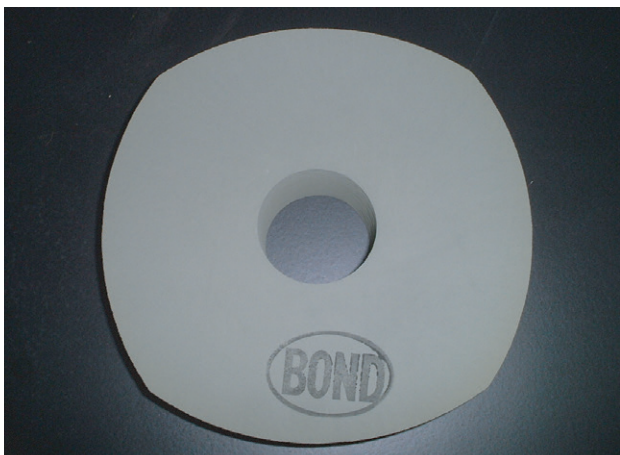
Shape of 704-type grinding wheel