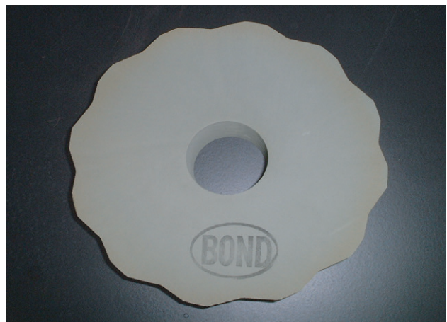
Shape of 878-type grinding wheel